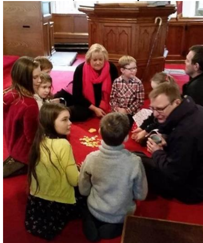
Fish Club after All age Worship

Although there is no longer a youth club in the village, Capernwray Hall hosts monthly Rock Solid meetings for 14-25 year olds for fun, fellowship and following Jesus.