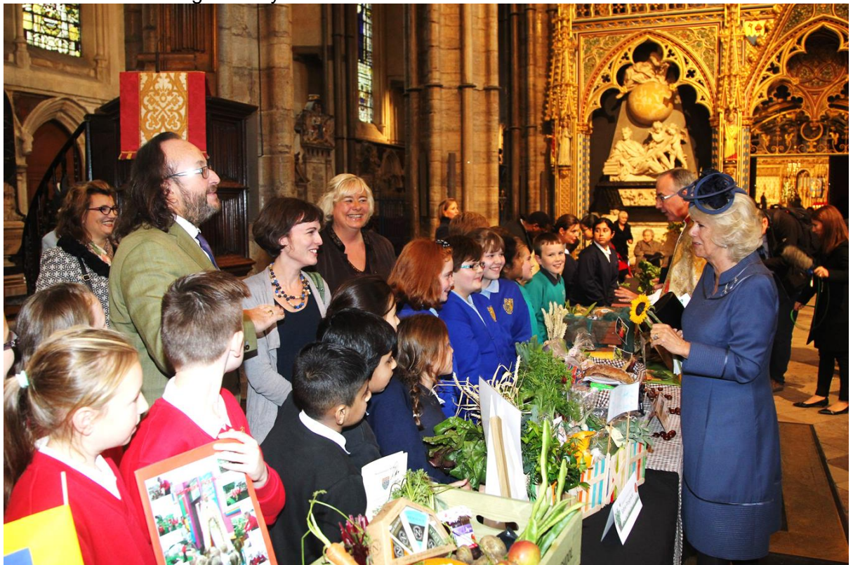
School head-teacher and pupils in Westminster Abbey in 2015

The Statutory Inspection of Anglican and Methodist Schools (SIAMS) graded the school as outstanding in every area.