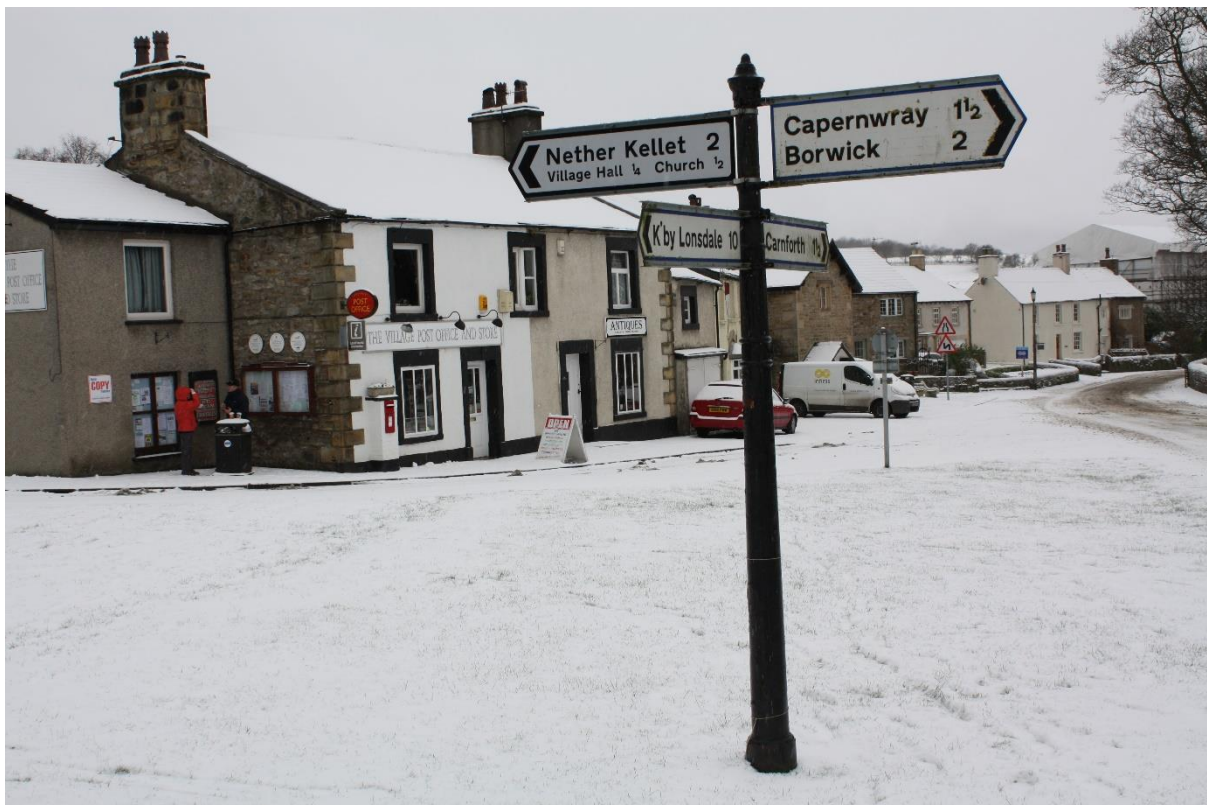
Over Kellet Village Green in winter

Further information about the Parish is available at www.overkellet.org