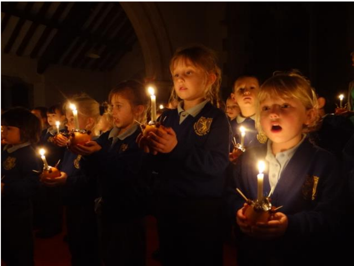
Christingle Service at St Cuthbert's

Whilst the drop in attendance at the 'standard' Sunday Services is of concern, lessons can be learned from the 'Special Services' attendance.