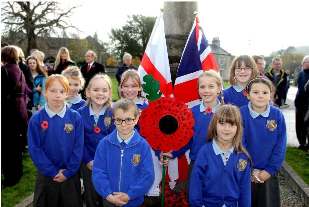
Pupils from school at Remembrance Day Service on Village Green

The March edition of the Diocesan See Magazine reminded us, if we do nothing....nothing will happen, as we reflect on our MAP we are so grateful for all that has been achieved in our Lord's strength and His ministry at St Cuthbert's.